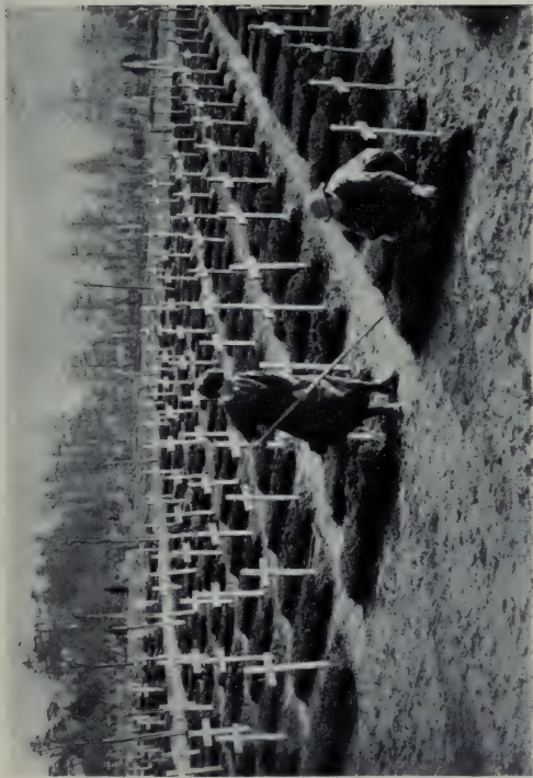
W.A.A.C. Gardeners at work in a Cemetery.